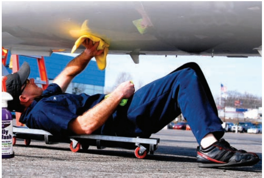
Excessive discharge of oil on the belly is often caused by excessive blow-by in one or more cylinders—but not always. Unless the oil is turning dark and opaque very quickly after each oil change, blow-by probably isn't the cause.

While an engine oil leak is a third possible escape route that could account for increased oil consumption, it's the least likely in my experience. While engine oil